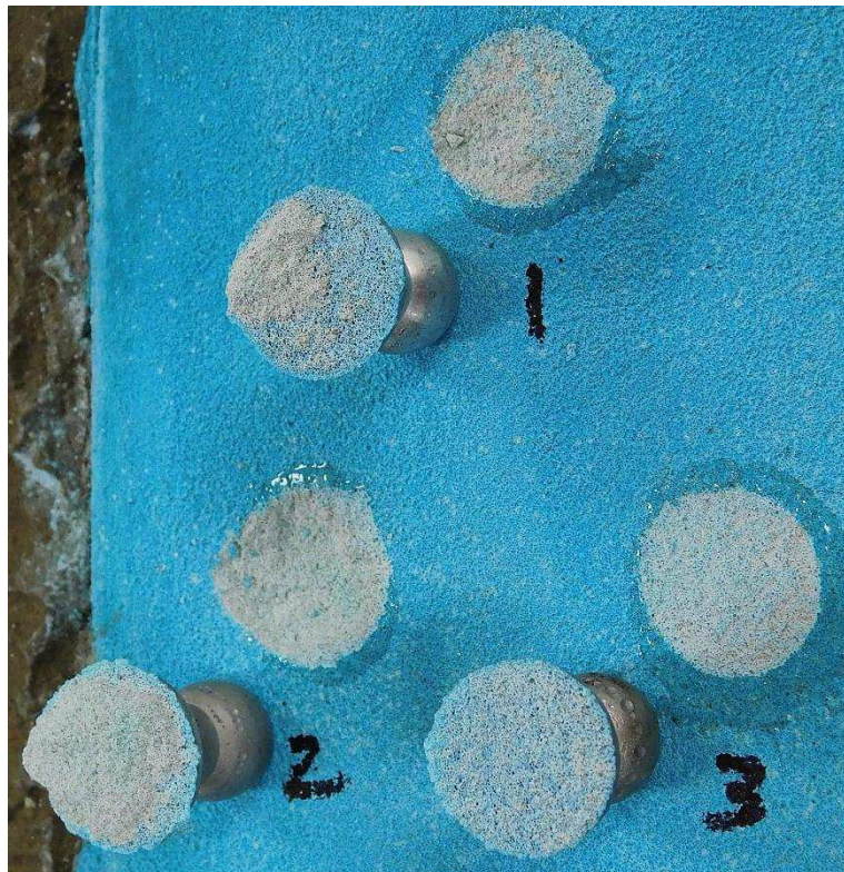
Sample 2: Three individual completed tests with corresponding dollies after pull-off adhesion – (See above)