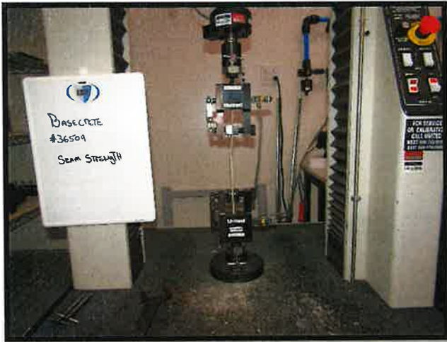
Seam Strength Test