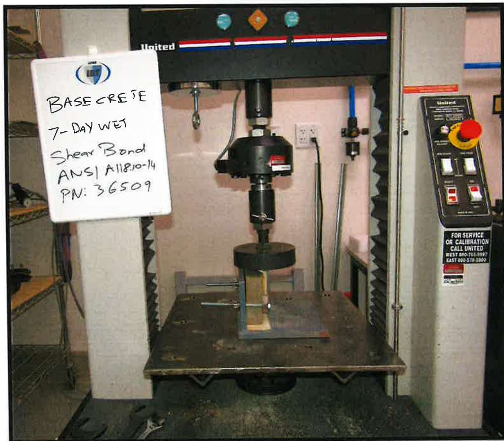
Shear Strength Test