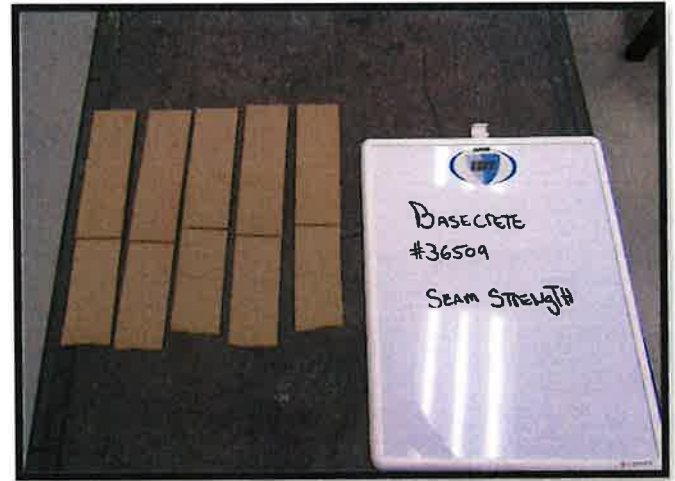
Seam Strength Test Samples